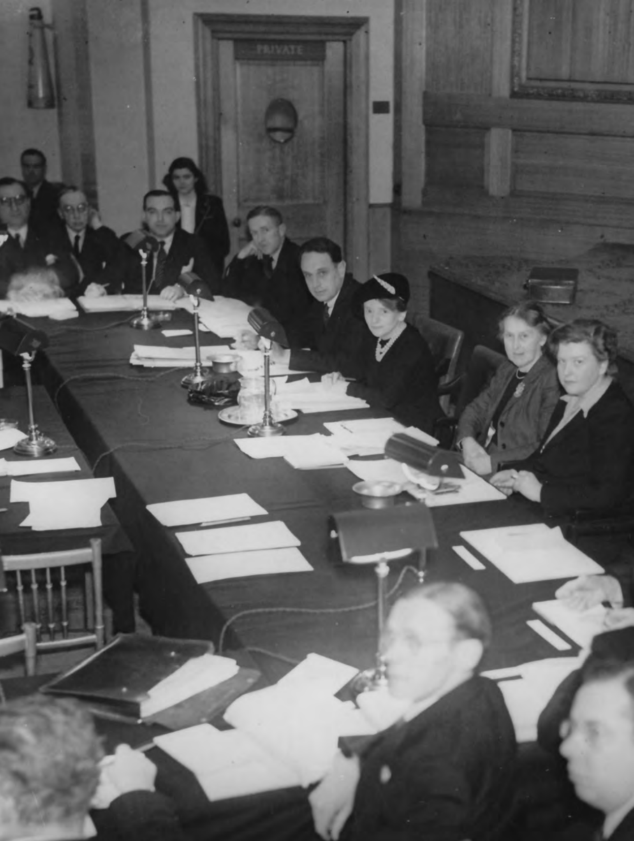
At the heart of UNESCO for over 70 years - UNESCO was founded in London in November 1945. The UKNC was established in early 1946.