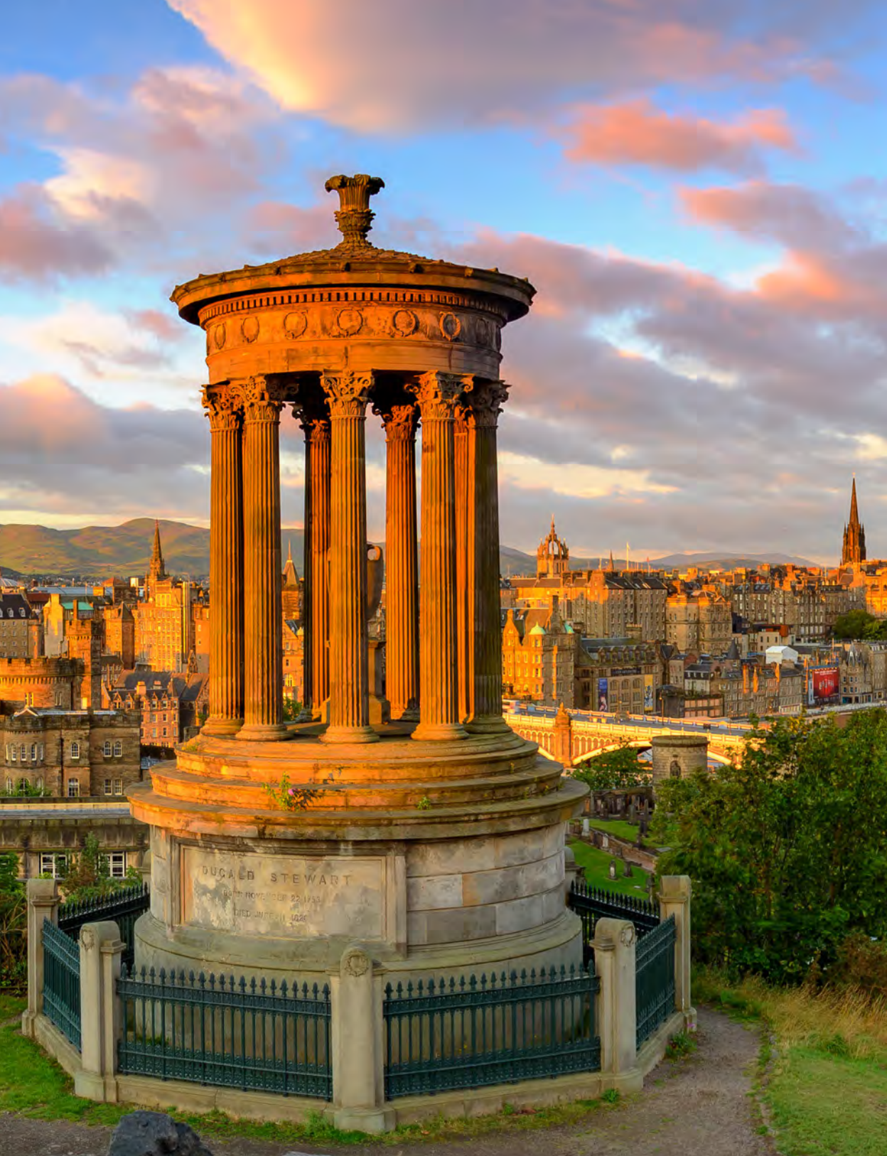
Panoramic of Edinburgh Castle from Calton Hill. Edinburgh is UNESCO Creative City of Literature, and the Old and New Towns of Edinburgh is designated as a UNESCO World Heritage Site